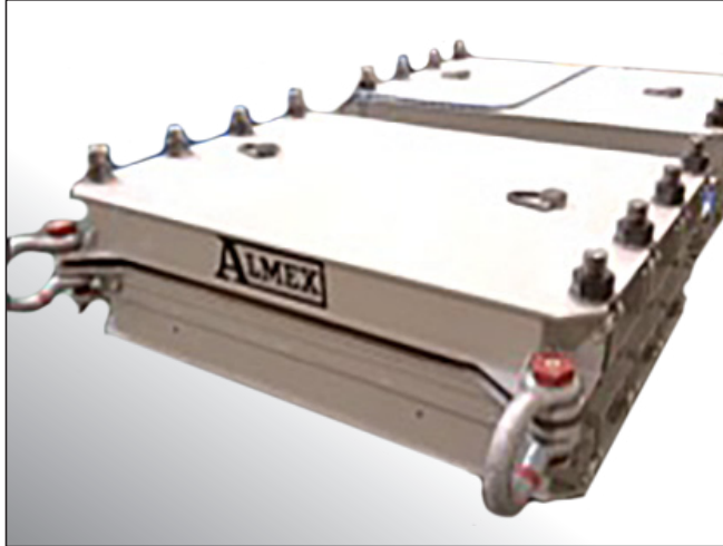
Air Brake Units