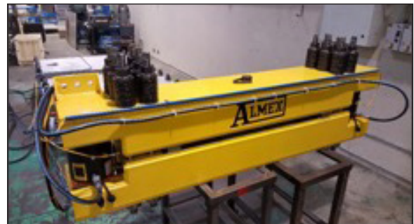
Hydraulic Over Spring