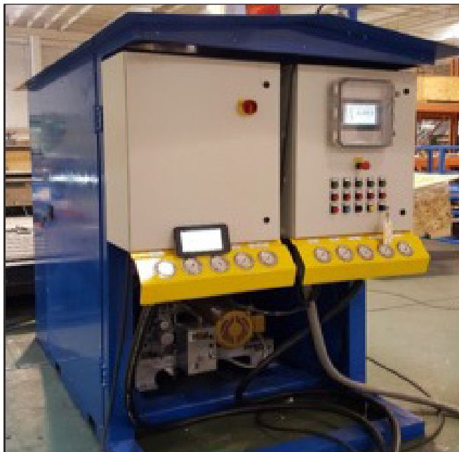
Control & Power Units

The stresses and forces exerted on the equipment are substantial. Almex uses only drives, couplings and frame construction that exceed standards to ensure the safety of the operators and protect your infrastructure. Commissioning and start-up services are available and Almex provides extensive documentation on operation, and maintenance of the units.