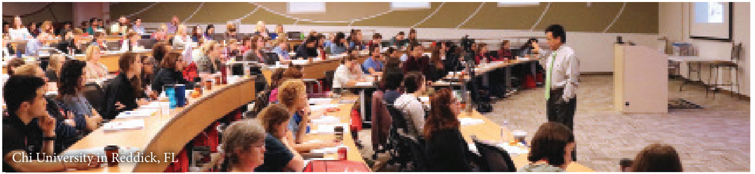
Chi University in Reddick, FL