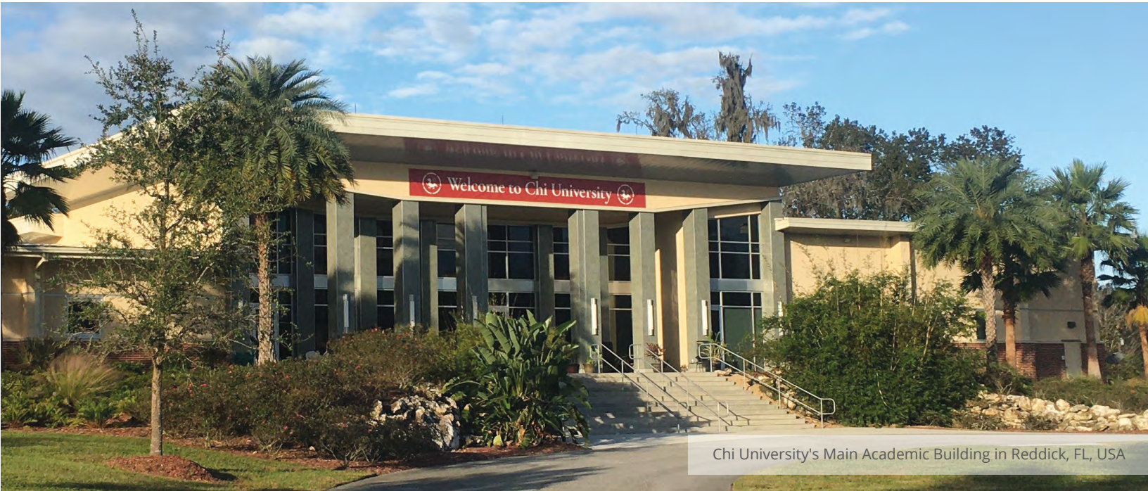
Chi University's Main Academic Building in Reddick, FL, USA